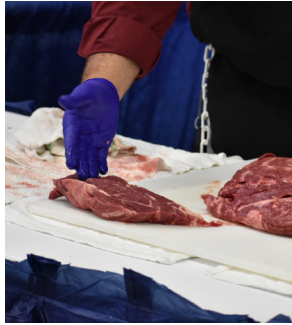
SELLING BEEF TO CONSUMERS