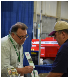
DEDICATED TRADESHOW HOURS